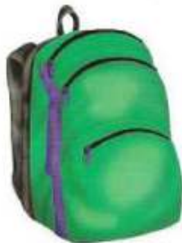
3. a bag