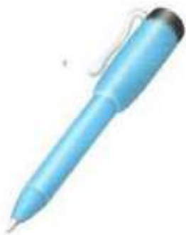
2. a pen