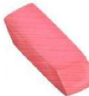
8. an eraser