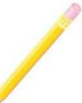
1. a pencil