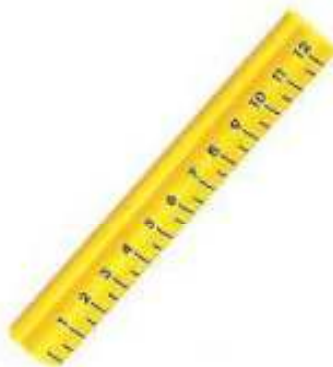
7. a ruler