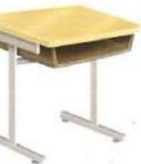
5. a desk