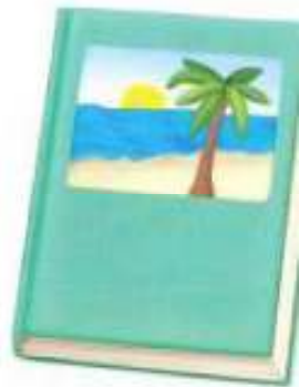
4. a book