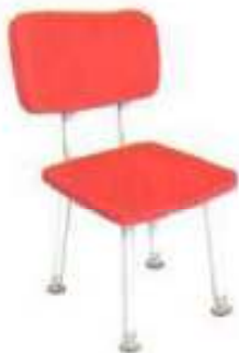
6. a chair